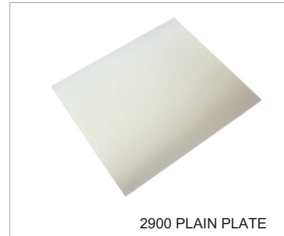
2900 PLAIN PLATE