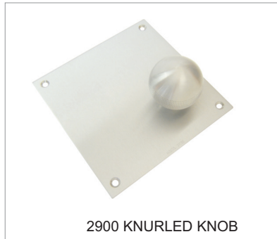
2900 KNURLED KNOB